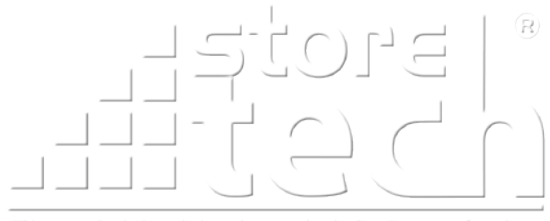
Electricidad Industrial & Doméstica